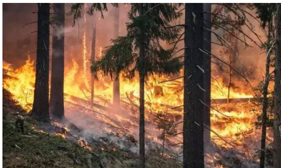
Fig. 1. The California wildfire (2017)

The forests are vital part of the nature. They provide shelter for animal species, protects soils from erosion, regulates air currents and precipitation, purifies the air and as a result maintain the biological balance of our planet. Unfortunately forest are often victim of fires which cause serious damages to the economy, environment and in some cases lead to human loses [1]. Only in 2017 forest fires have resulted to $14 billion insurance losses in the world which is the highest historical record. Among the most devastating fires is the wildfire in California (Figure 1), estimated on more than $9 billion loses [2].